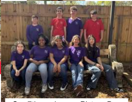
Our 7th graders on Picture Day