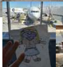
Flat Stella & Flat Stanley went on Spring Break!