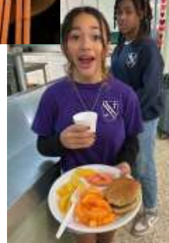
Yes, lunch is orange, but all the food groups are there!