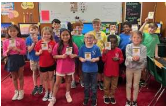
The Second Graders solved a mystery and are computer detectives!