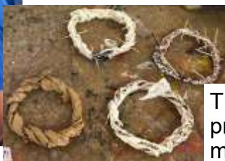
The students in Art have a very special project going right now. Expect to see more about that soon!