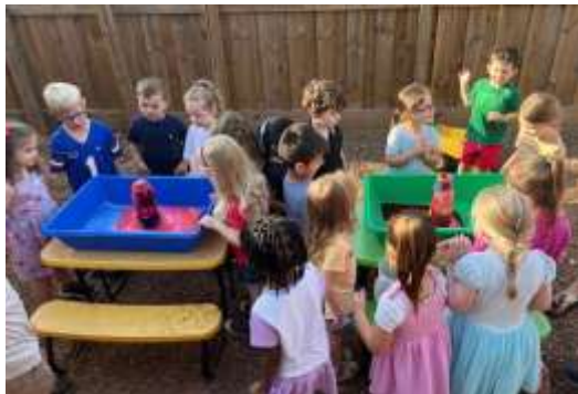
Science & Letters in Preschool: V for Volcano!