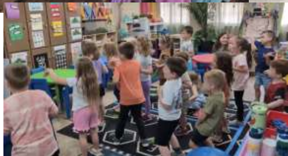
Sometimes ya' just gotta' dance!