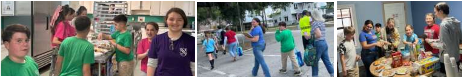
Sometimes snack's in the kitchen and other times it's across the street in our Youth Room, All the times, it's good!

We created Holy Week Tableaus. Can you guess the Holy Week story we were telling?