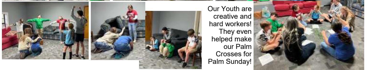
Our Youth are creative and hard workers! They even helped make our Palm Crosses for Palm Sunday!