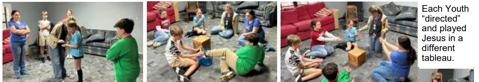
Each Youth "directed" and played Jesus in a different tableau.