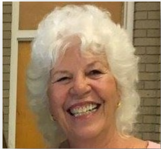
Choir News July 2023

It is very difficult to write the July news in the middle of June. All I can think about is what is happening at this time, so I am going to share my thoughts about now.