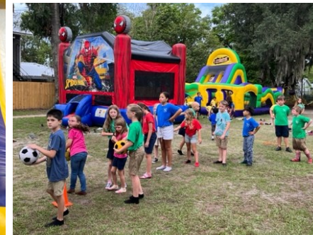
Don't forget the bounce houses and food truck!