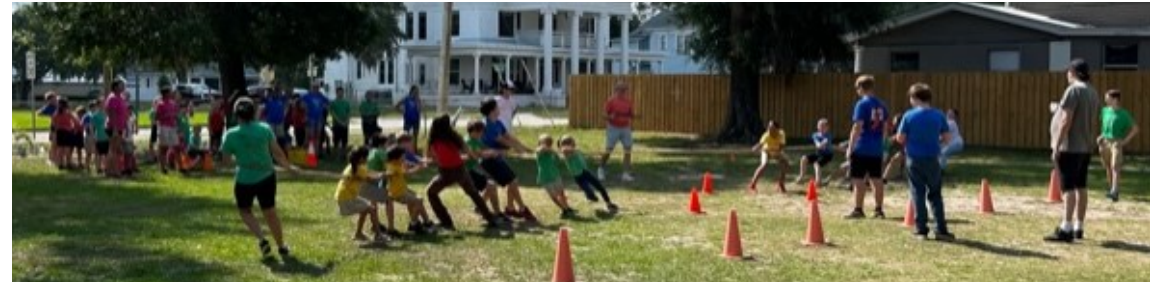
Field Day was hard work, but the fun was worth it!