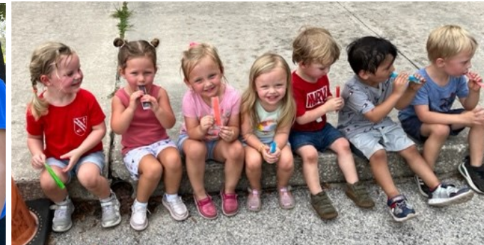
Thank goodness there was lot's of water and... ice pops!