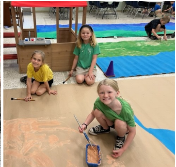
Even while celebrating....