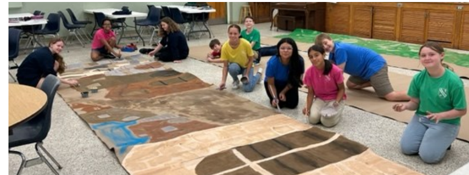
Our amazing students helped paint backdrops for VBS!